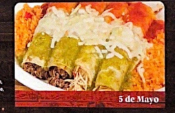
5 de Mayo