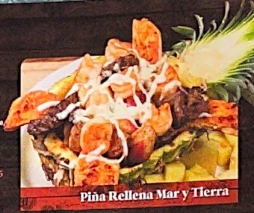
Pina Rellena Mar y Tierra